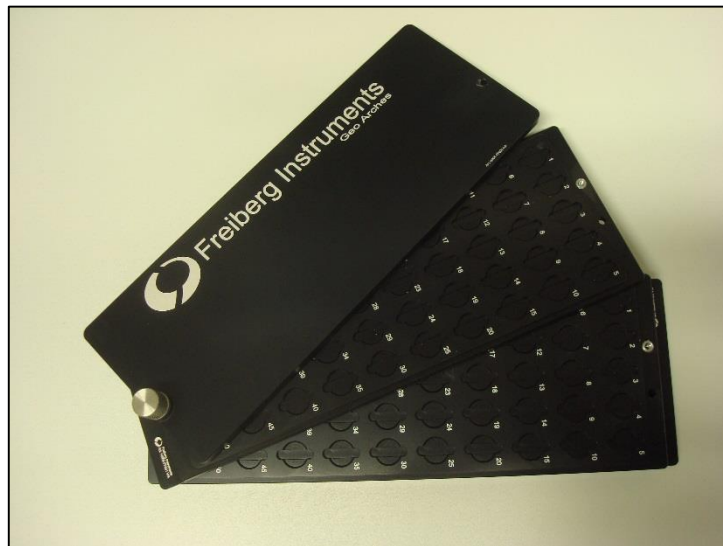
Figure 2: Aliquot storage

Step 1: Open the screws on both ends of the Aliquot Storage stack to reveal the Aliquot Storage Trays (Figure 2).