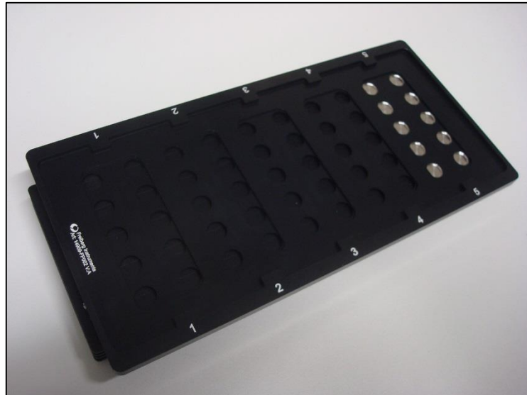
Figure 4: Sample cups added to the Aliquot Storage Trays

Step 3: Place the suitable sample cups on the Aliquot Storage Trays for Silicon Oil Stamping and then place the Template for Silicon Oil Stamping on top of the Aliquot Storage Tray as shown in Figure 4.