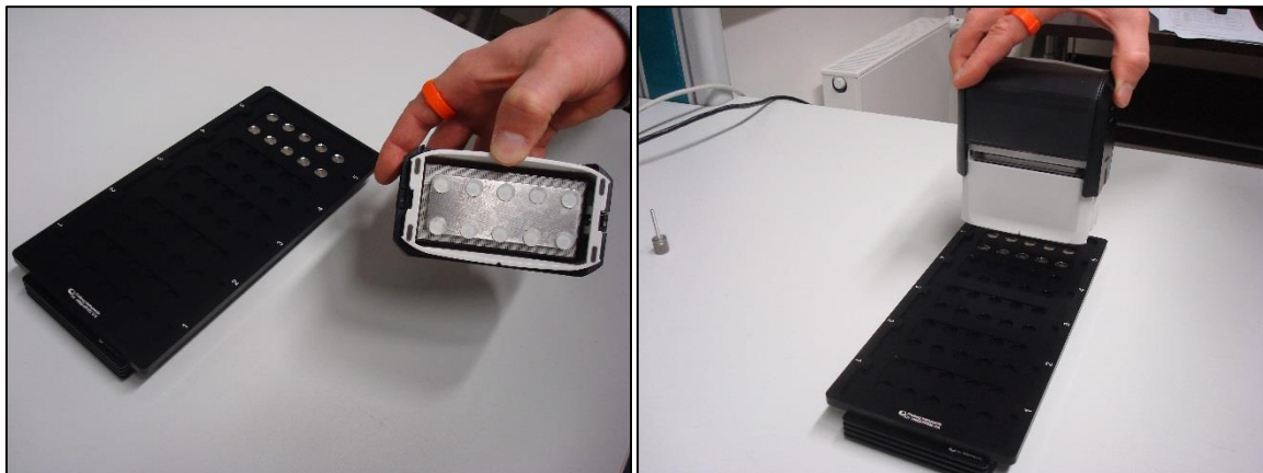
Figure 5: Using the Silicon Oil Stamp

Step 4: As shown in Figure 5, stamp up to 10 sample cups with Silicon Oil at a time.