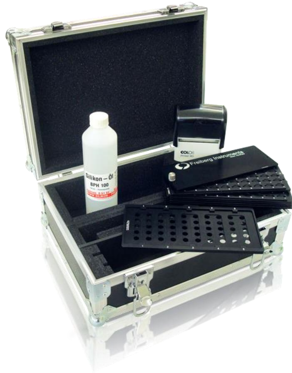
Figure 1: Aliquot Preparation Kit

The Aliquot Preparation Kit (Figure 1) contains the following components: